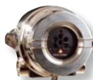
Fire Sentry Series