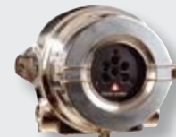
Fire Sentry Series