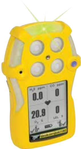
GasAlertQuattro from BW Technologies by Honeywell

To replicate this scenario, we conducted a series of tests inside a temperature chamber. One group of tests subjected the detector to room temperature for an hour, followed by an hour at -20°C (-4°F) and then back to room temperature for a third hour. Another series tested the opposite conditions: an hour at room temperature, followed by an hour at 40°C (104°F), followed by an hour back to room temperature. We also conducted further tests that subjected the detector to a series of alternating temperatures of very hot or very cold, cycling every half hour, over an 8-hour period.