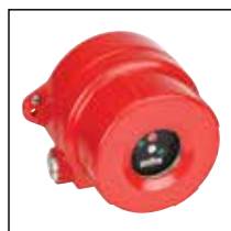
Multi-Spectrum QuadBand Triple IR Flame Detectors