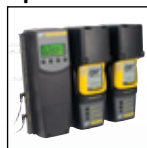
MicroDock II compatible