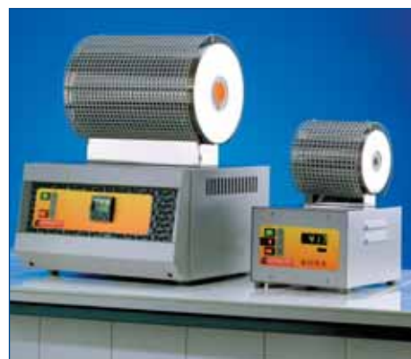
MTF 12/38/250/3216 & MTF 10/25/130/301

The majority of these models utilise a resistance wire heating element, which is wound around the outside of a ceramic worktube making it an integral part of the heating element. If the tube is required to contain an atmosphere or is likely to be contaminated by spillage, an additional work tube should be used. The thermocouple is located in a protected position between the outside of the work tube and the heating element, allowing the full work tube diameter to be used and protects the thermocouple from mechanical damage.