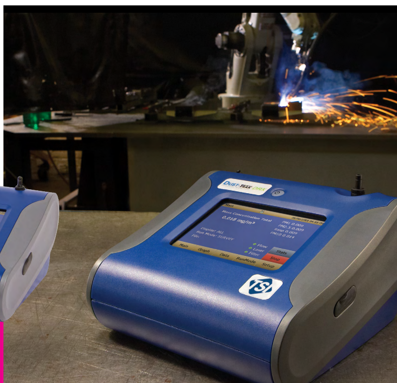
Desktop Monitor with External Pump, Model 8533EP