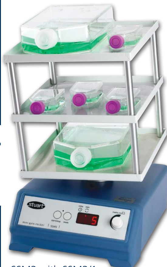
SSM3 with SSM3/1