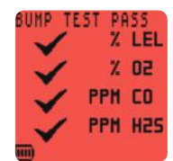
Configurable bump options