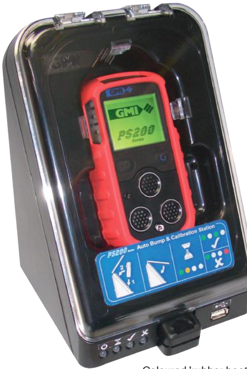
Coloured 'rubber boot' for multi-site or multi-application working (7 colours available)

To complement the Personal Surveyor product line, 3M has developed a compact, robust and easy to use Auto Bump & Calibration Station that can provide full bump and calibration options. Data transfer is facilitated using a USB memory stick with Standalone software that is simple to set up and customise based on end users' specifications. Standalone, PC, and ethernet versions are available.