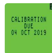
Configurable calibration options